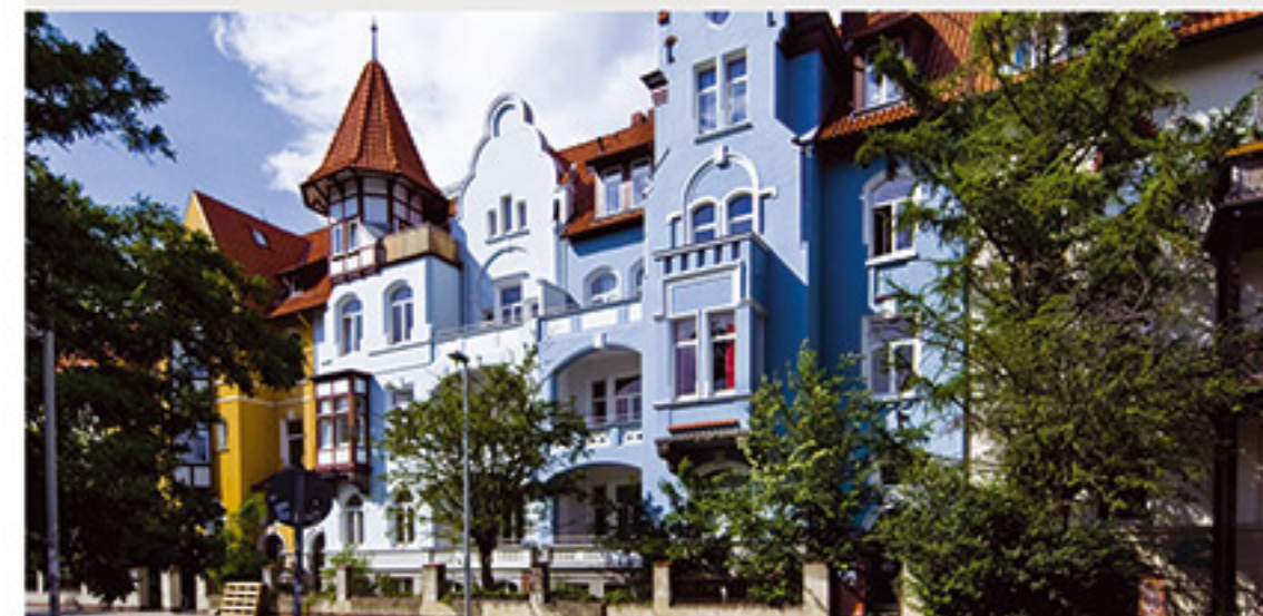
Student residence Callinstraße 18