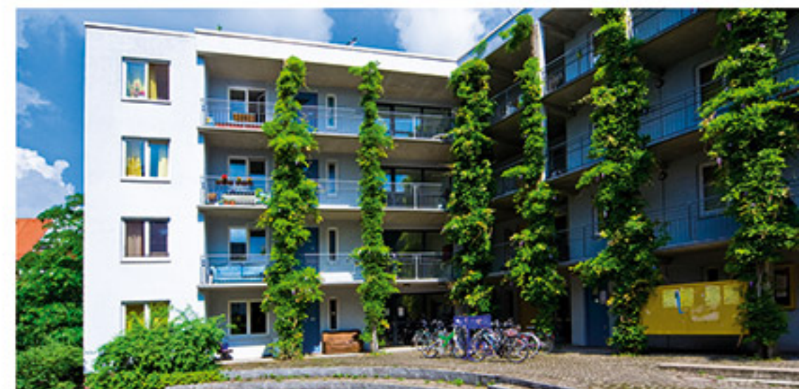
Student residence Callinstraße 25